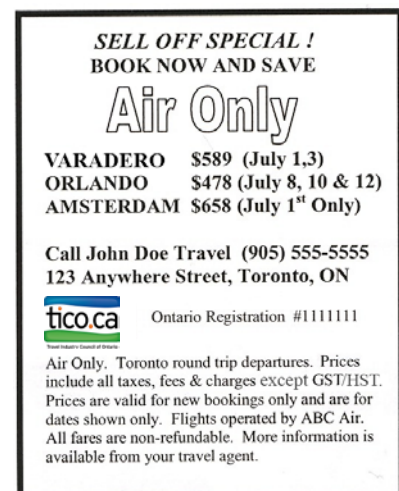
Figure 3.1: An example of a correct advertisement.