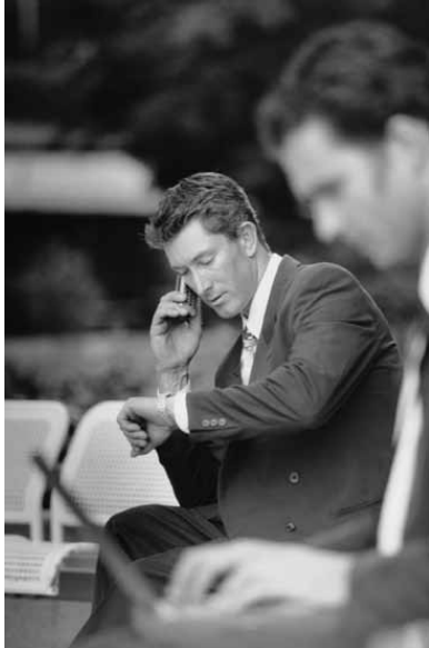
Section 33 of the Regulation