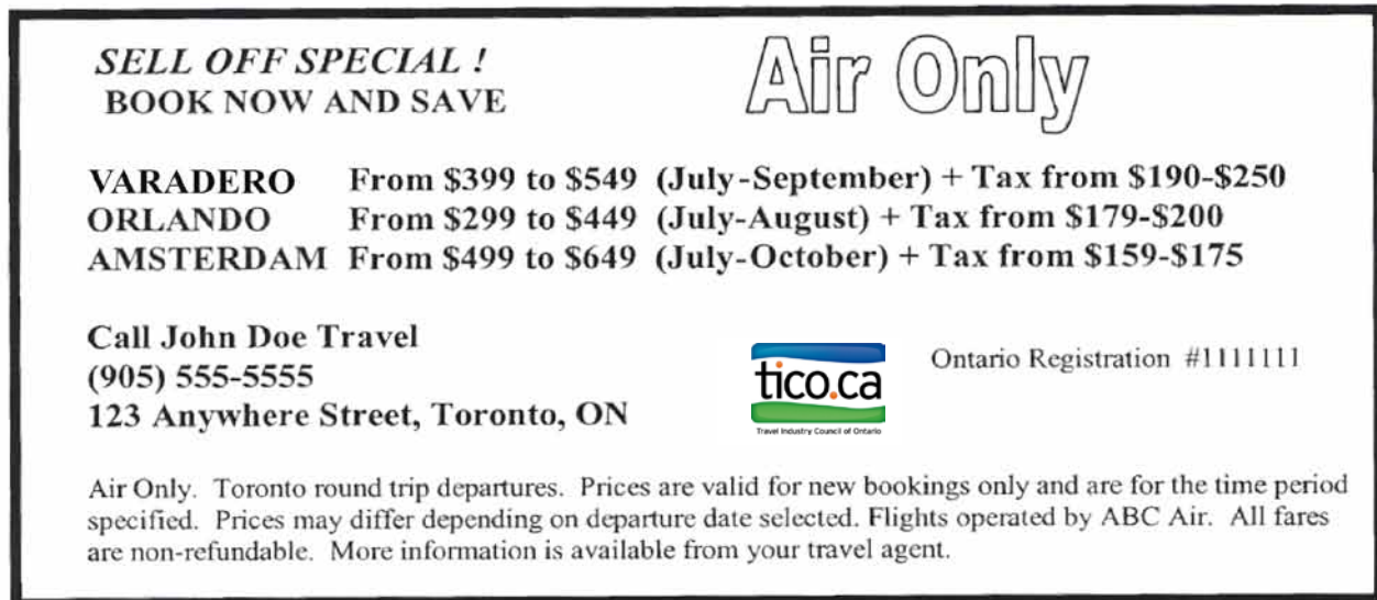
Figure 3.2: An example of an advertisement that meets the requirements in showing “from ... to” prices.

into an agreement with the registrant for those travel services when the information becomes available.