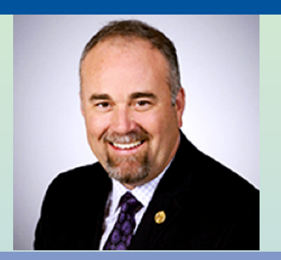
The Honourable Todd Smith, Minister of Government and Consumer Services, and MPP, Bay of Quinte

First elected as an MPP in October 2011, the Hon. Todd Smith was re-elected in June 2014 and again in June 2018. In addition to serving as the Minister of Government and Consumer Services, he holds the position of Government House Leader.