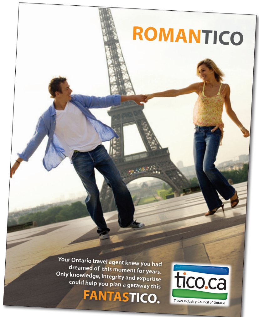
Sample consumer ads

By working together, we’re making our industry stronger!